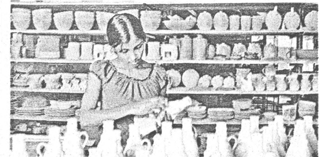
A woman entrepreneur displays her products

This census will also help evolve a clear definition for SMEs in Sri Lanka under current economic conditions. The department has employed over