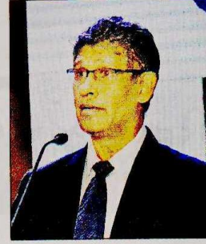
Surveyor General P.M.P. Udayakantha

and private sector can benefit. This is a platform that maintains a spatial database intended to create a common environment where all stakeholders and the public can cooperate with each other, access relevant data, make timely decisions as well as contribute in providing relevant data for others to use. This will enable data sharing, avoid duplication in data collection, increase efficiency and collaboration among organisations.